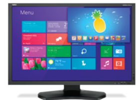
Picture in Picture shown with 2 separate inputs