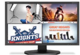
Picture by Picture shown with 4 separate inputs