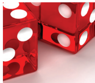
10 bit color eliminates banding

The MultiSync PA322UHD offers 10 bit color support over DisplayPort and HDMI inputs for increased color fidelity when matched with a 10 bit operating system and software applications.