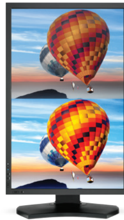
Picture by Picture shown with the same input, multiple color spaces

The PA322UHD allows for two different inputs to be shown simultaneously, which is useful for multiple computer configurations or even replacing multiple display setups. The same input can also be displayed in a second color space, which is most often used for a quick preview of an output color space (for example, sRGB) while working in a different color space (for example, Adobe RGB). This saves the time used to switch back and forth between color spaces as final editing tweaks are made.