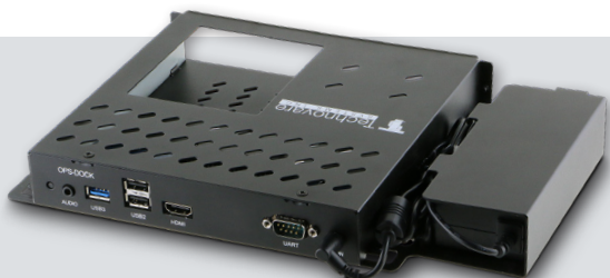
*OPS-DOCK is an accessory and is not included with any version of the OPS.