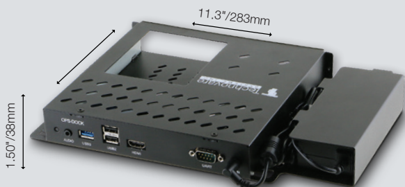
*OPS-DOCK is an accessory and is not included with any version of the OPS-PCIB.