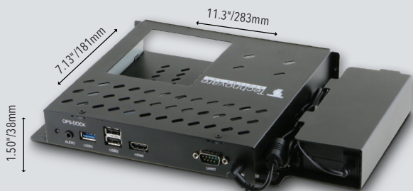
*OPS-DOCK is an accessory and is not included with the OPS-PCAEQ.