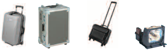
VT65ROLLER VT60ATAPRO LEATHERROLLER LAMP