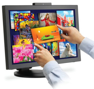
E232WMT with multi-touch LCD and FHD webcam