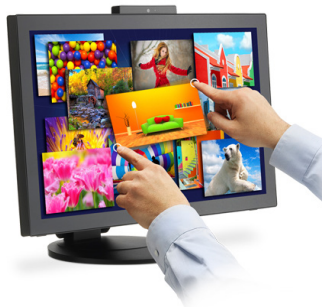
E232WMT with multi-touch LCD and FHD webcam